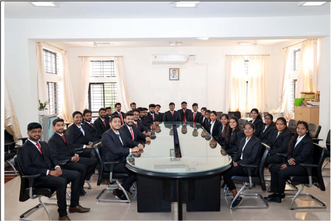
MBA (ABM) Students in Conference Hall