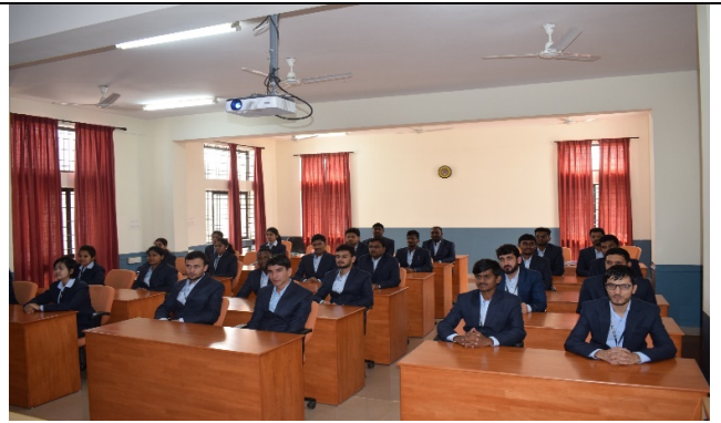
MBA (ABM) Class Room