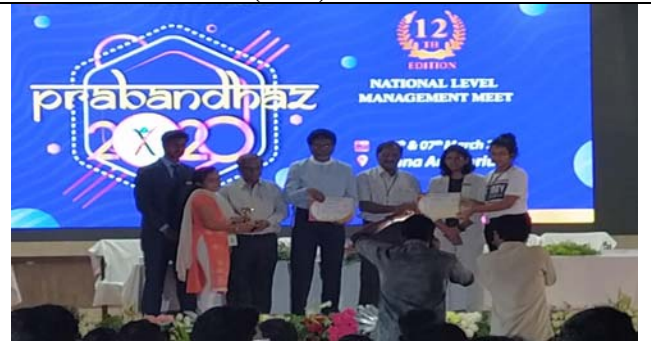
Participation in Quiz/Competition by Students